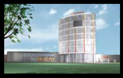
Holmatro N.V. World Headquarters Raamsdonksveer, The Netherlands