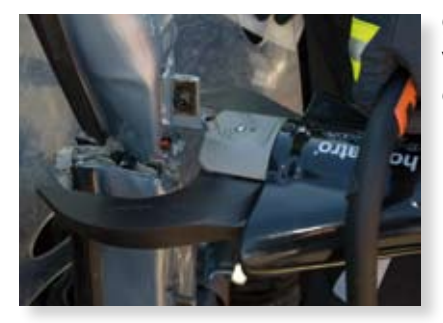
Complex and reinforced Volvo B-pillar cut by CU 4055 C NCT™II.