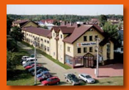
Holmatro Polska Sp. z.o.o. Manufacturing, sales & service