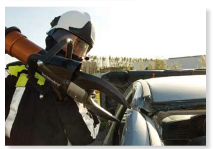
Wide Volvo C-pillar cut by CU 4055 C NCT™II.